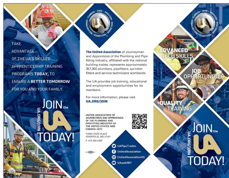
New customizable brochures for training centers

All you require to enroll in this class is an interest in recruitment and the desire to expand our ranks. Training directors are encouraged to attend, but if there’s an instructor or person at your training center who would be an ideal candidate for recruitment ambassador, do not hesitate to send them to this invaluable class.